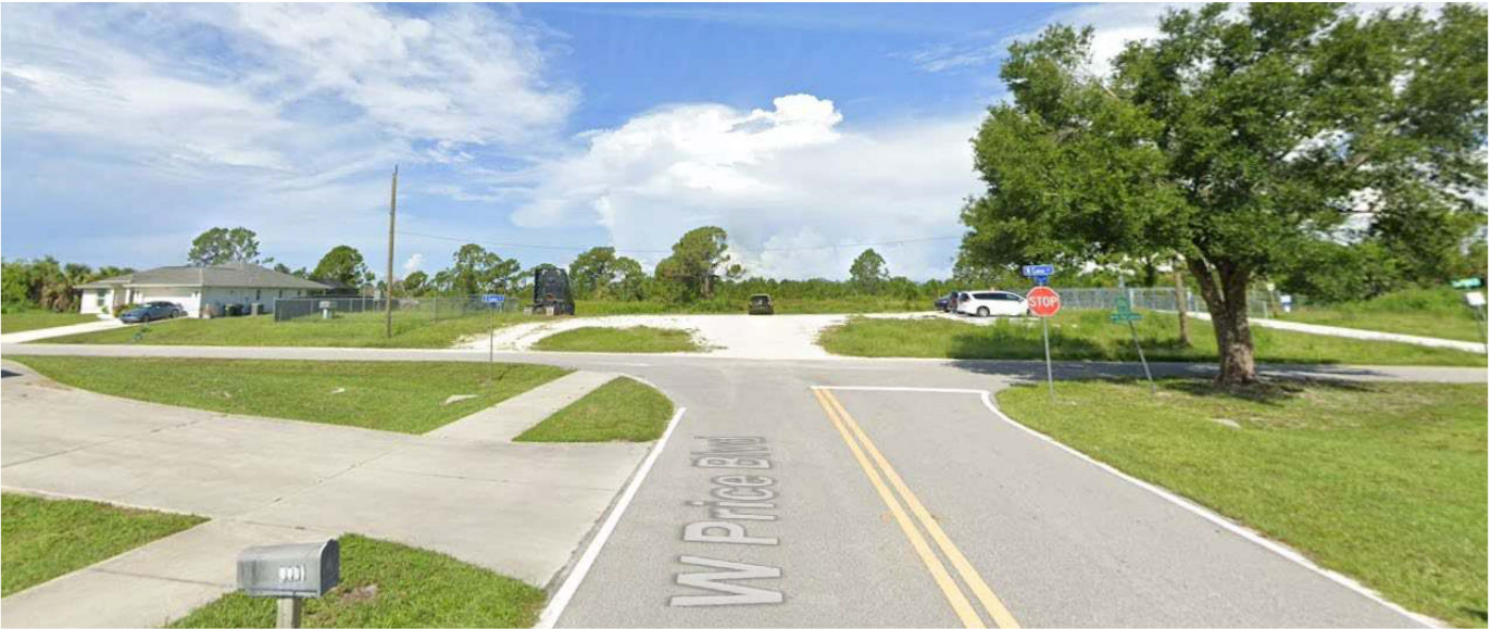
Price Boulevard at Calera Street Proposed eastern end of road extension