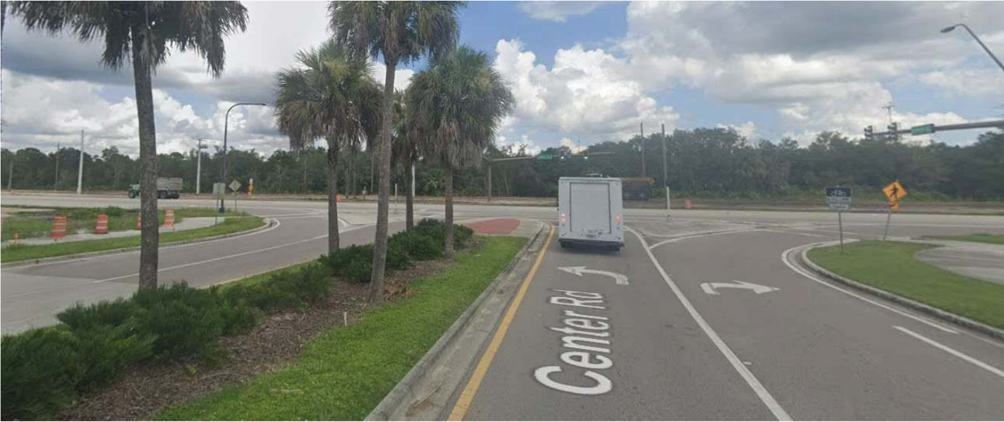
Center Road at River Road Proposed western end of road extension