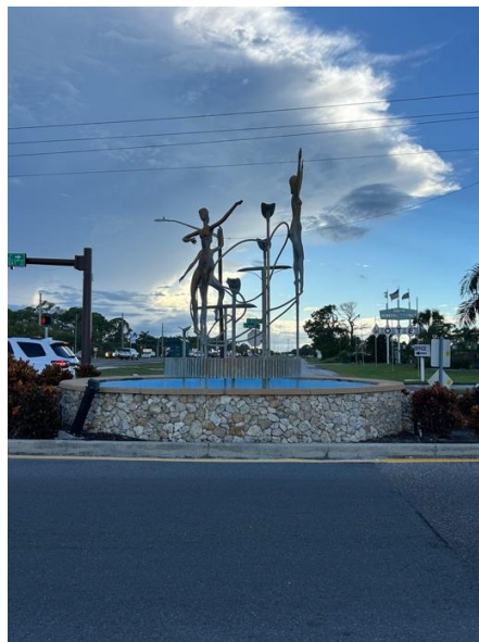
Looking north from Ortiz Blvd