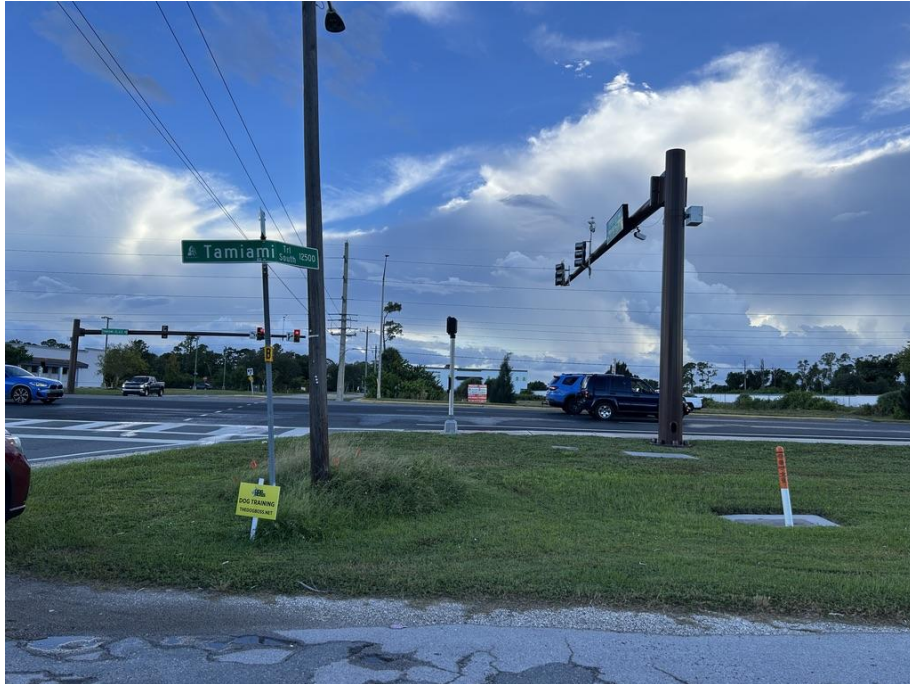
Looking west from northeast corner