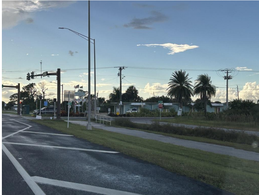
Intersection – sculpture on the right in the boulevard – where is it???