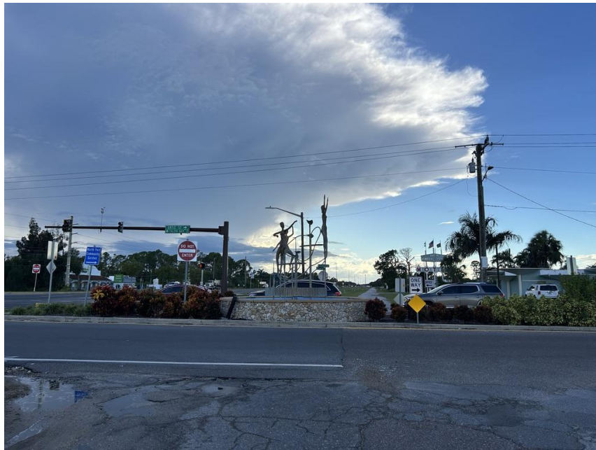
Looking north from southeast corner