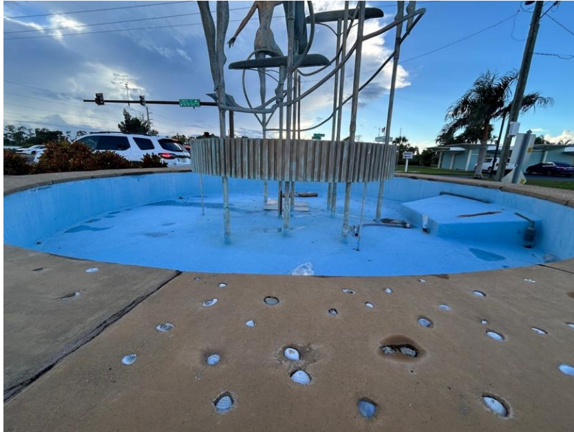
Concrete top with embedded shells.