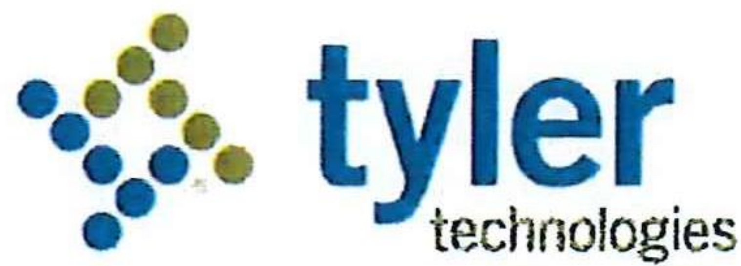
Exhibit B Invoicing and Payment Policy

We will provide you with the software and services set forth in the Investment Summary of the Agreement. Capitalized terms not otherwise defined will have the meaning assigned to such terms in the Agreement.