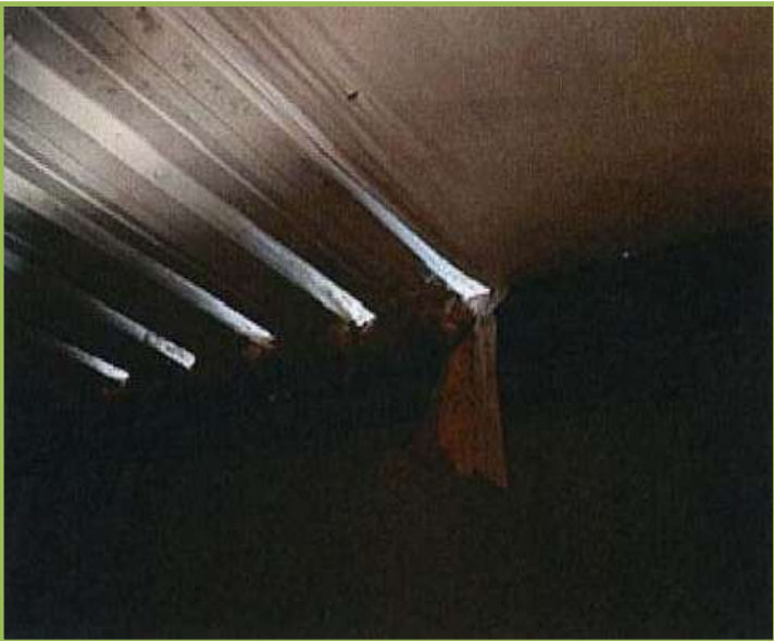
Exterior roof panel openings, exposing the interior to the elements