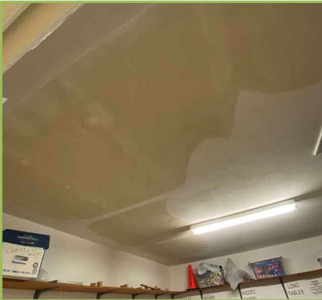
Water damage on the ceiling