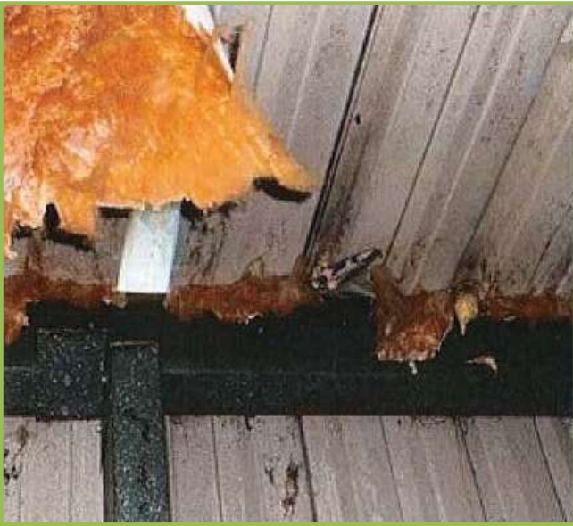
Perimeter purlin corrosion causing openings in roof deck