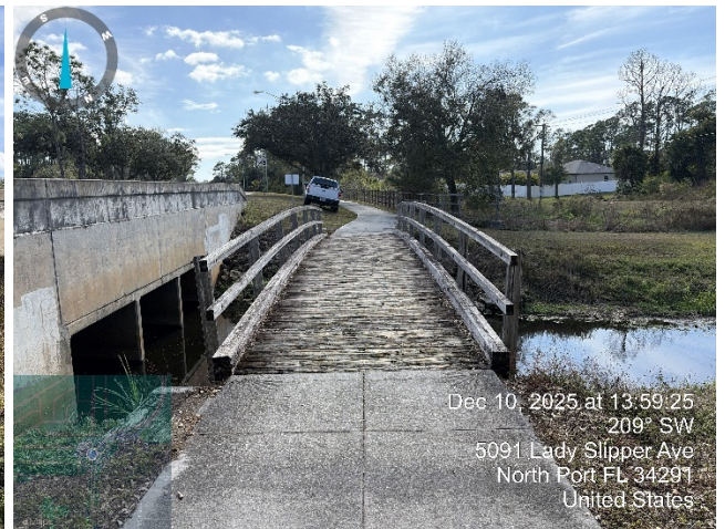
Figure 2: Bridge #6