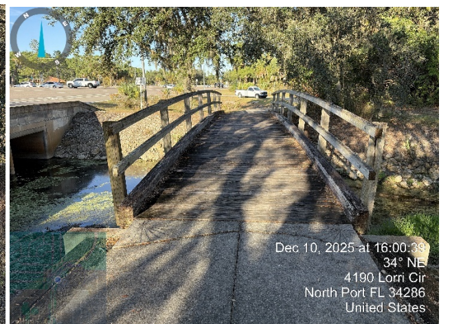
Figure 3: Bridge #8