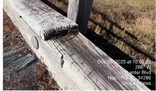
Figure 9: Delamination in Arch Beam at Bridge 5