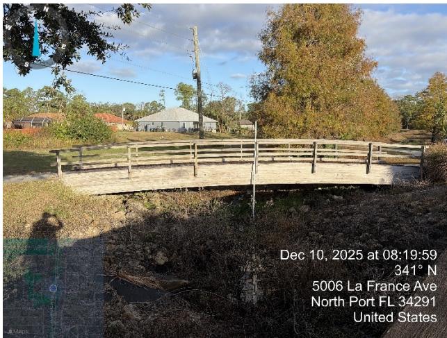
Exhibit 1 – Bridge Overview