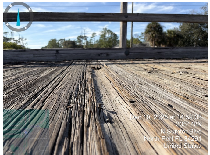
Figure 7: Worn decking creating tripping hazard at Bridge 6 (typical for all bridges)