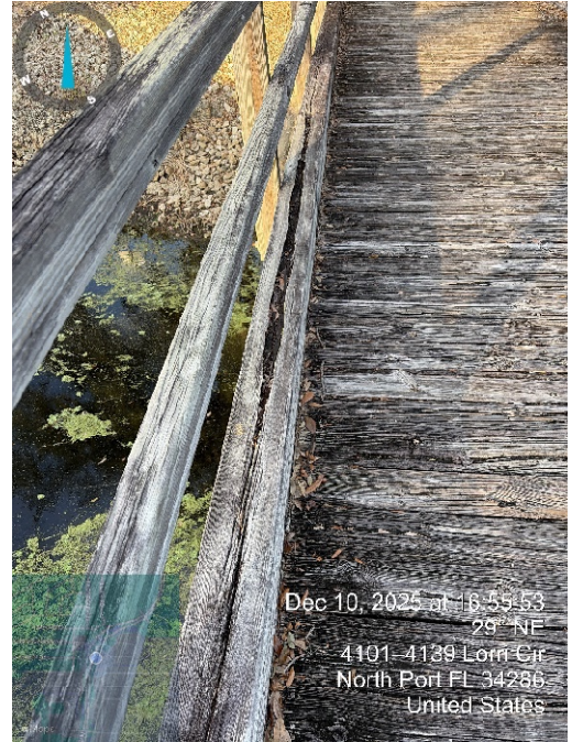
Figure 6: Rot in top of arch beam at Bridge 8