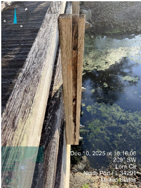
Figure 5: Rot in railing post at Bridge 8 (typical for all bridges)