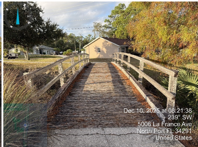
Figure 1: Bridge #5