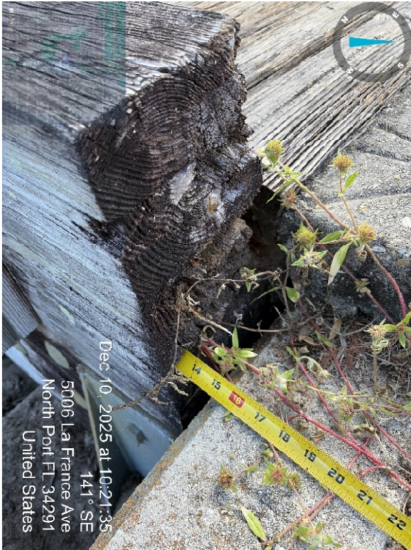
Figure 4: Rot in arch beam end at Bridge 5 (typical for all bridges)