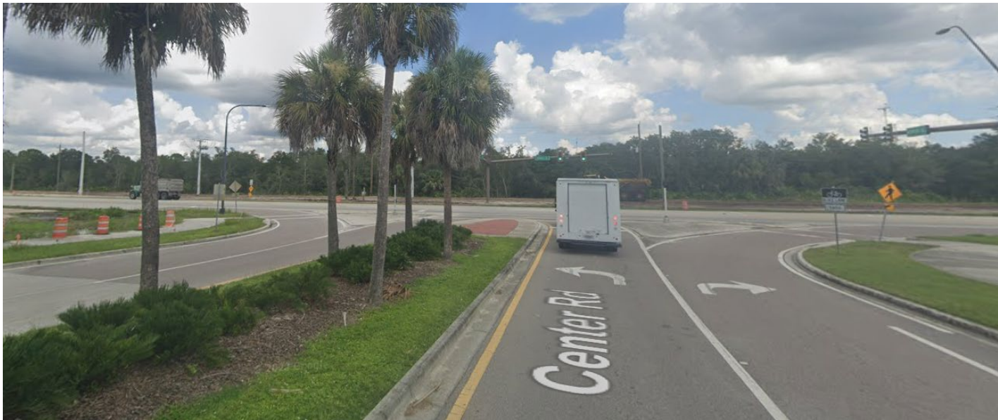
Figure 2. Center Road at River Road. Proposed western end of road extension, looking East toward location of Price Blvd and Calera St.