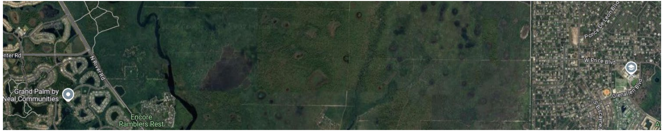
Figure 3. Aerial detail of proposed area of construction with Price Blvd on the far right and proposed intersection at Center Road and River Road on the far left.