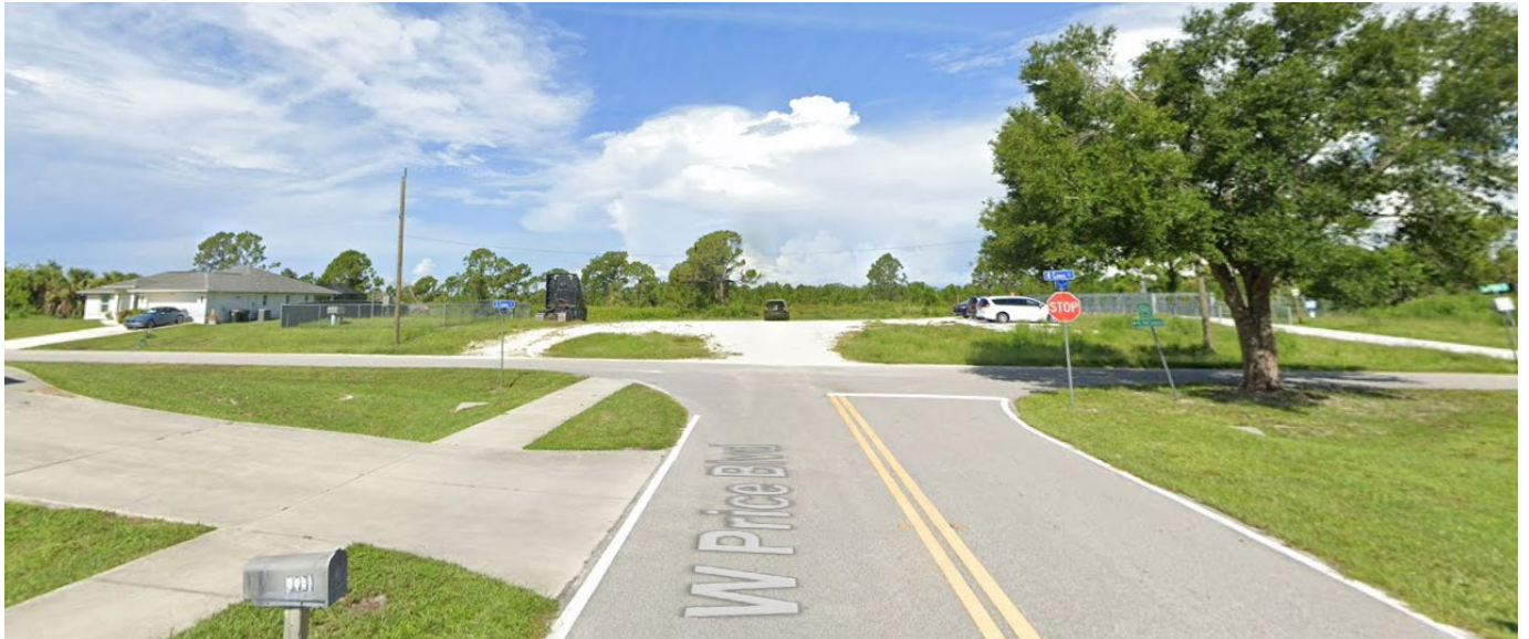
Figure 1. Price Boulevard at Calera Street. Proposed eastern end of road extension, looking West toward location at River Rd where Price will intersect.