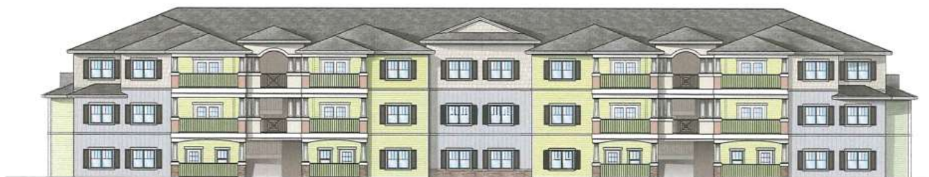
Street Elevation Building Architectonics Studio

Based on information from the United States Census Bureau (2016) 38.5% of renter households in the City of North Port are 'cost burdened' - that is they pay more than 30% of household income towards their housing. Of that percentage, 19% of renter households earn less than $20,000 annually, which is in the extremely low-income category. Another 14.5% earn between $20,000 and $34,999 which is in the low- to very low-income category. To address the 'cost burdened' issue the developer will provide 108 units of affordable rental stock with rents restricted to target households at 60% and 33% AMI, the low- and very low-income demographics in the City.