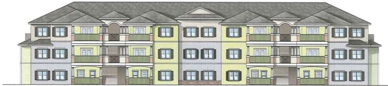
Street Elevation Building Architectonics Studio

Based on information from the United States Census Bureau (2016) 38.5% of renter households in the City of North Port are 'cost burdened' - that is they pay more than 30% of household income towards their housing. Of that percentage, 19% of renter households earn less than $20,000 annually, which is in the extremely low-income category. Another 14.5% earn between $20,000 and $34,999 which is in the low- to very low-income category. To address the 'cost burdened' issue the developer will provide 108 units of affordable rental stock with rents restricted to target households at 60% and 33% AMI, the low- and very low-income demographics in the City.