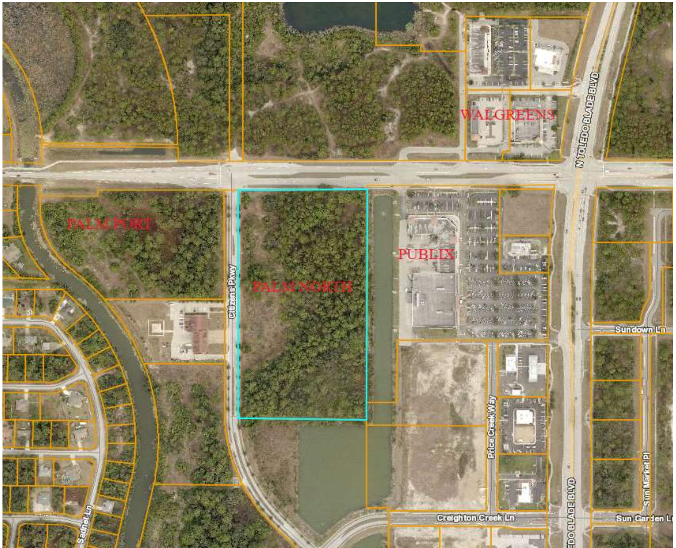
Figure 6 - Elevation