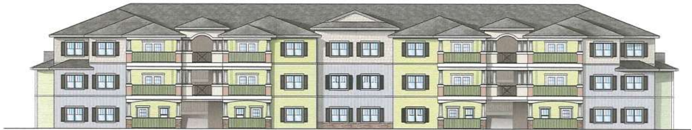
Street Elevation Building Architectonics Studio

Based on information from the United States Census Bureau (2016) 38.5% of renter households in the City of North Port are 'cost burdened' - that is they pay more than 30% of household income towards their housing. Of that percentage, 19% of renter households earn less than $20,000 annually, which is in the extremely low-income category. Another 14.5% earn between $20,000 and $34,999 which is in the low- to very low-income category. To address the 'cost burdened' issue the developer will provide 108 units of affordable rental stock with rents restricted to target households at 60% and 33% AMI, the low- and very low-income demographics in the City.