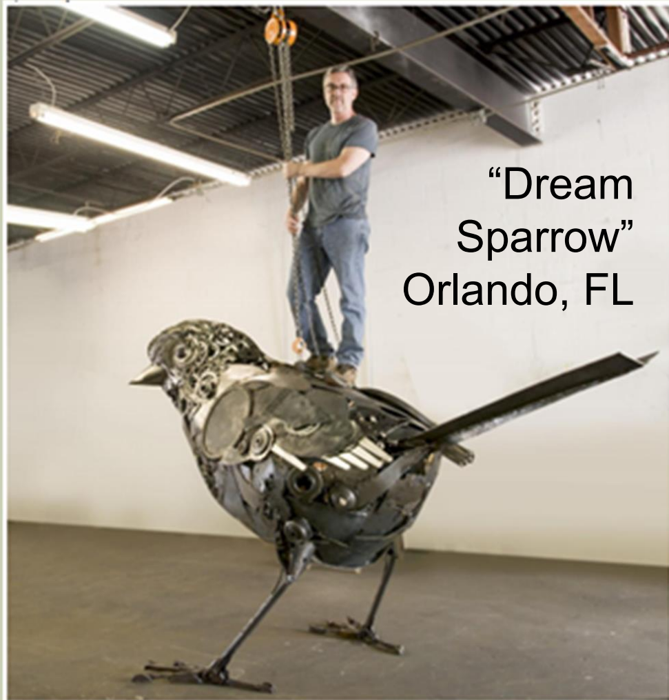
“Dream Sparrow” Orlando, FL