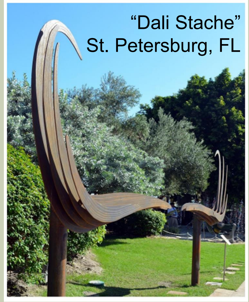
“Dali Stache” St. Petersburg, FL