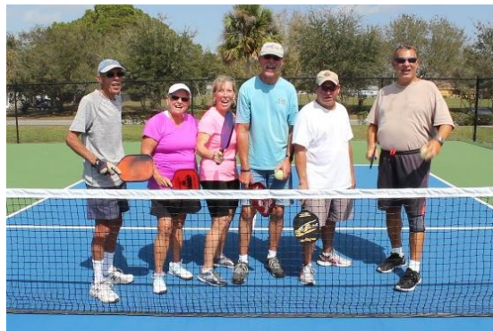
Highland Ridge Park

Blue Ridge Highland Ridge Hope Kirk Labrea Marius McKibben Oaks Pine Veterans