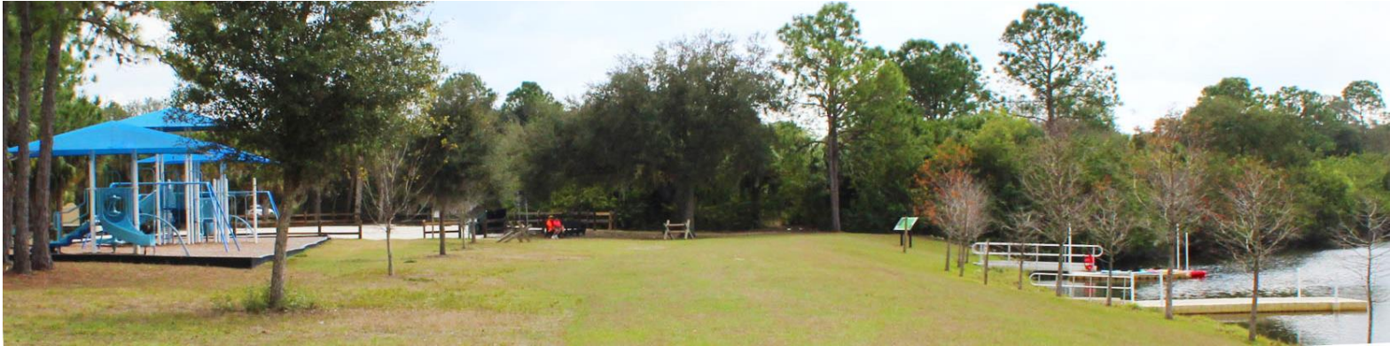
Blue Ridge Park

Blue Ridge Highland Ridge Hope Kirk Labrea Marius McKibben Oaks Pine Veterans