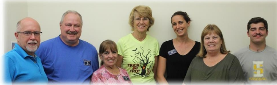
Parks & Recreation Advisory Board