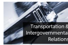
Transportation & Intergovernmental Relations