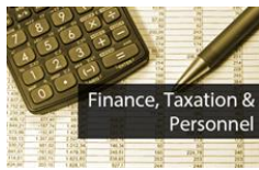
Finance, Taxation & Personnel