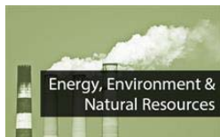
Energy, Environment & Natural Resources