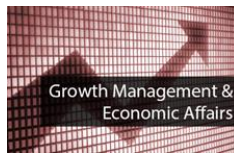
Growth Management & Economic Affairs