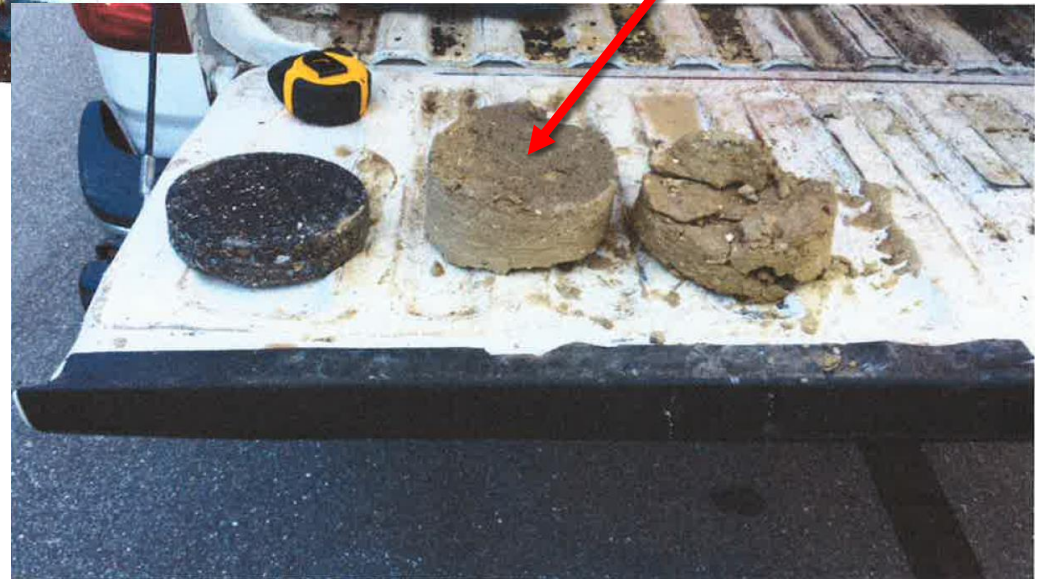
Good Condition Base