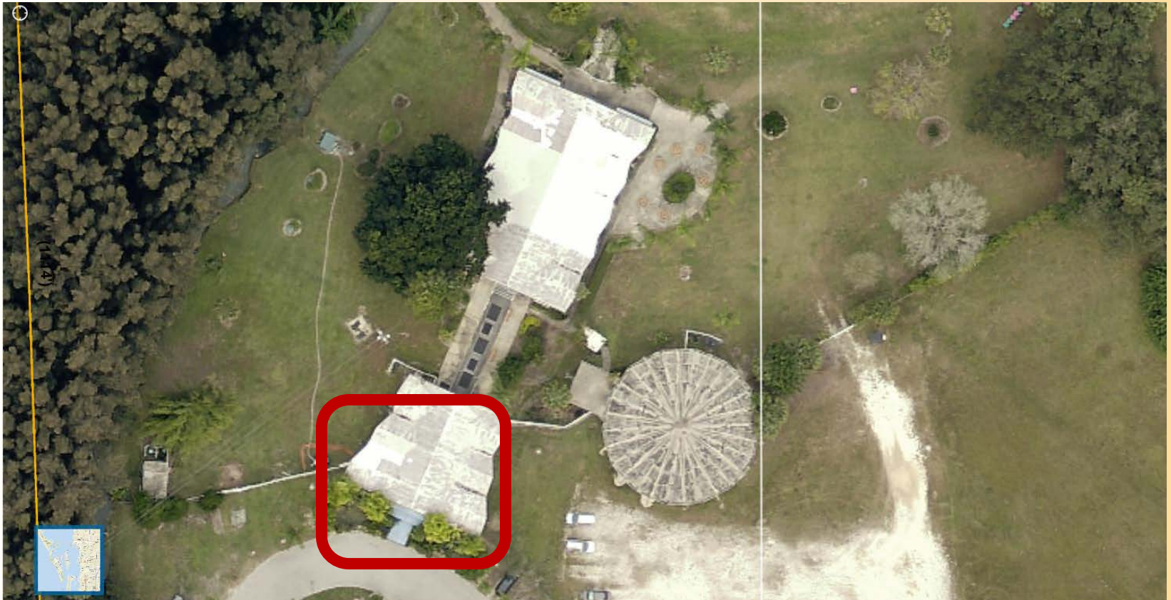
South Spa Building