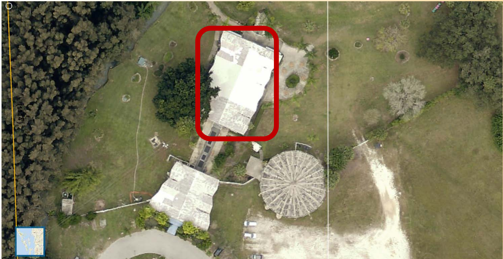
North Spa Building