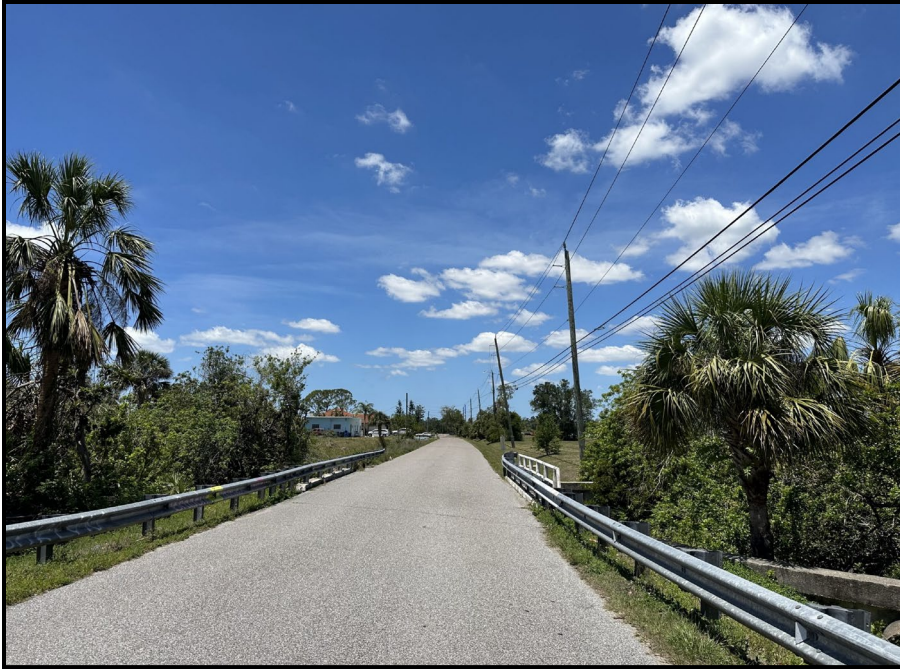
Representative Site Photo: Bridge over creek crossing