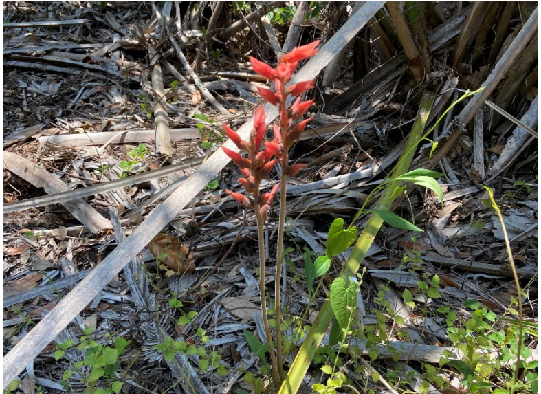
Leafless beaked ladiestresses found on eastern side of Survey Area.

Invasive and exotic plant species were also noted during the field inspection. The most commonly found invasive species were Australian Pine ( Casuarina equisetifolia ) and Brazilian Pepper ( Schinus terebinthifolia ). Large stands of Australian pine are present in several areas within the study area. This species shades and smothers native plants that grow nearby. Very little vegetation grows where this species is found. Brazilian pepper is another fast-growing species that crowds out native plants. This species is prevalent throughout central and eastern portion of the Survey Area. Table 3 lists the invasive plants observed during the field survey and their Florida Invasive Species Council rank. Category I species are invasive exotics that are altering native plant communities by displacing native species, changing community structures or ecological functions or hybridizing with natives. Category II species are invasive species that have increased in abundance or frequency but have not yet altered Florida plant communities to the extent shown by Category I species.