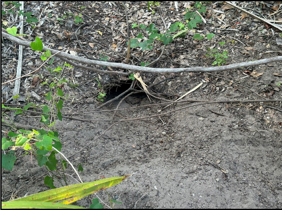
Gopher Tortoise Burrow #30 Potentially Occupied