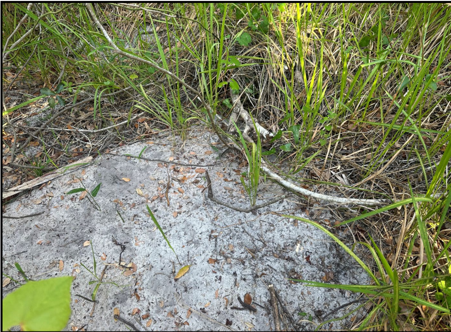
Gopher Tortoise Burrow #32 Potentially Abandoned