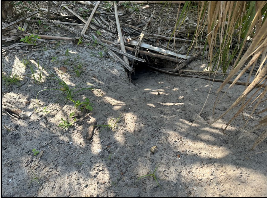
Gopher Tortoise Burrow #6 Potentially Occupied