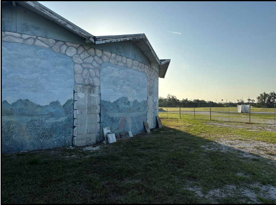
Representative Site Photo: Buildings