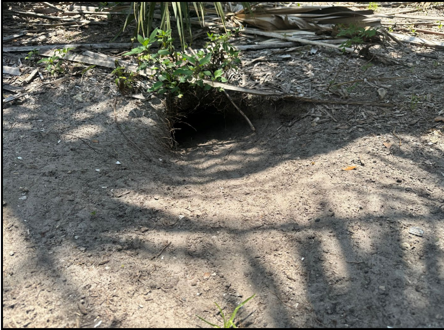
Gopher Tortoise Burrow #53 Potentially Occupied