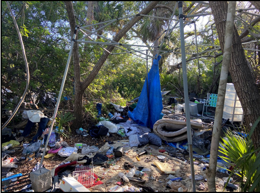
Representative Site Photo: Illegal Dumping