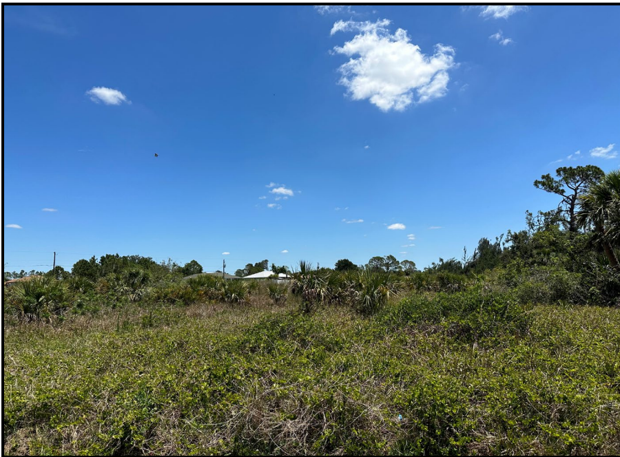
Representative Site Photo: Shrub and Brushland