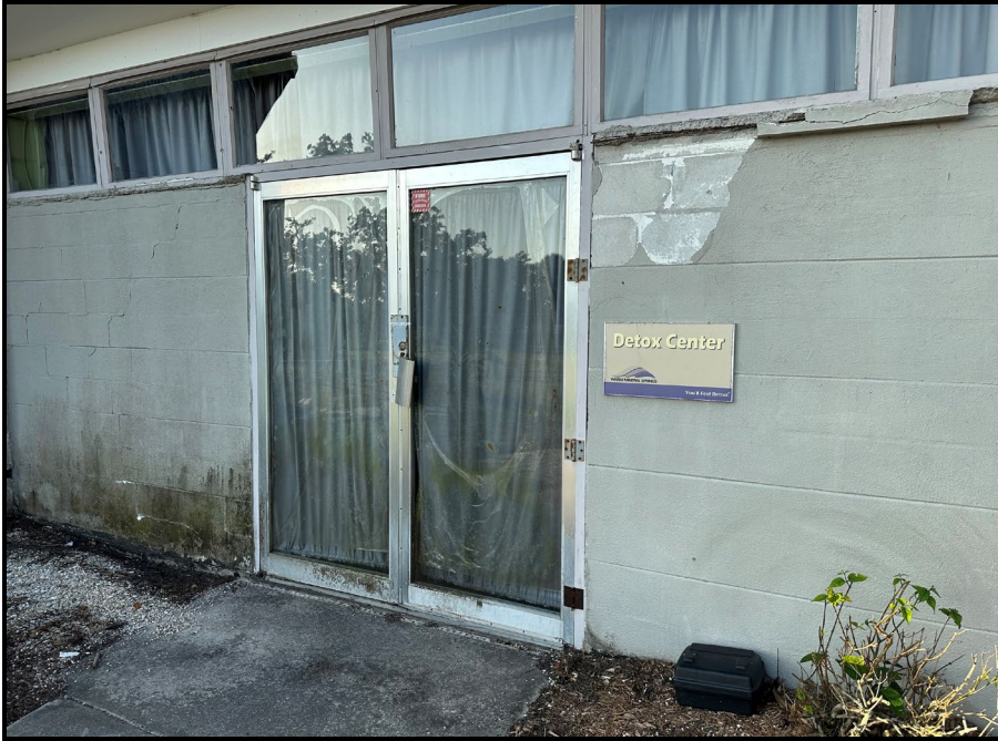
Representative Site Photo: Buildings