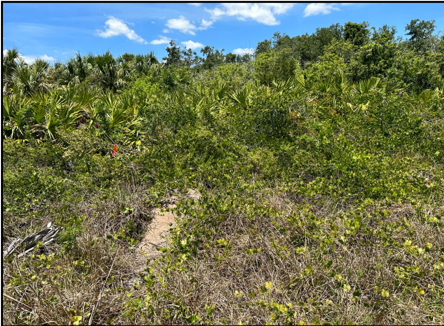
Representative Site Photo: Shrub and Brushland