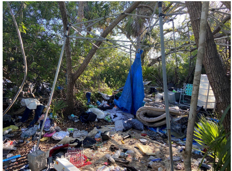
Several areas were covered in trash and some hazardous materials.

Numerous homeless encampments and dumpsites of yard and construction debris were encountered in Survey Area. This was most prevalent on the east side of the property, outside the park. Items within the encampments ranged from small items like clothing, household plastic containers, cans and other food containers, to large items like bicycles, mattresses, and furniture. Potential hazardous materials were discovered, including motor oil and discarded automotive batteries. One site, on the west side of the creek, was occupied at the time of the survey.