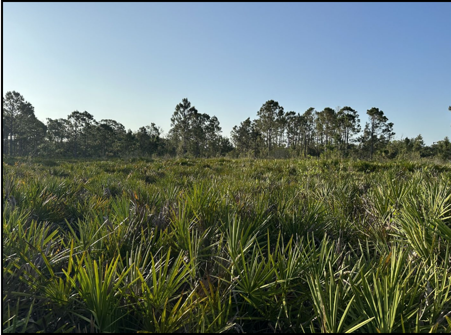
Representative Site Photo: Shrub and Brushland