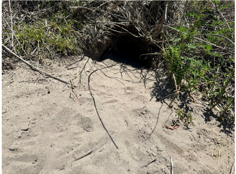
Representative burrow from the Survey Area.

In total, 109 gopher tortoise burrows were documented, with 88 burrows appearing potentially occupied and 21 burrows appearing abandoned. Each located burrow was marked with flagging tape, photographed, and the location was recorded with DGPS. Figure 1 shows a representative potentially occupied burrow. Gopher Tortoise population can be estimated by halving the number of potentially occupied burrows. This means that approximately 44 adult tortoises inhabit the property. A map depicting the locations of burrows and their status is included in Appendix C .