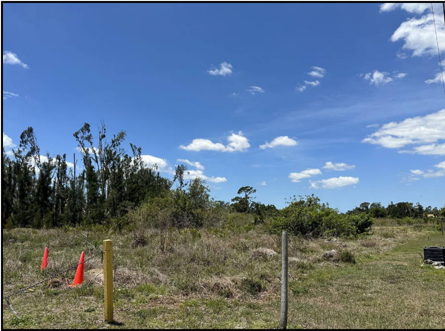
Representative Site Photo: Shrub and Brushland