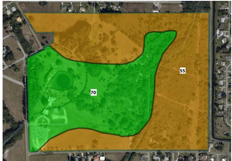
Gopher tortoise burrow suitability in the Survey Area.

The Web Soil Survey from the U.S. Department of Agriculture (USDA) Natural Resources Conservation Service (NRCS) was accessed to determine Gopher Tortoise Burrow Suitability of the Survey Area. The results are shown in Figure 2 . Soil suitability is rated as Highly Suited, Moderately Suited, Less Suited, or Unsuitable. The results indicated that 42% of the Survey Area is Highly Suited (70, Pomello fine sand, green shading) and the remainder is Less Suited (55, EauGalie-Myakka fine sands, orange shading). Less Suited soils have characteristics that limit establishment, maintenance, or use of the site by gopher tortoise. This may explain why Gopher Tortoise burrows were in more densely canopied areas where they are not typically found.