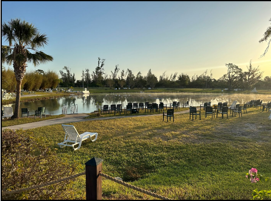
Representative Site Photo: Major Springs