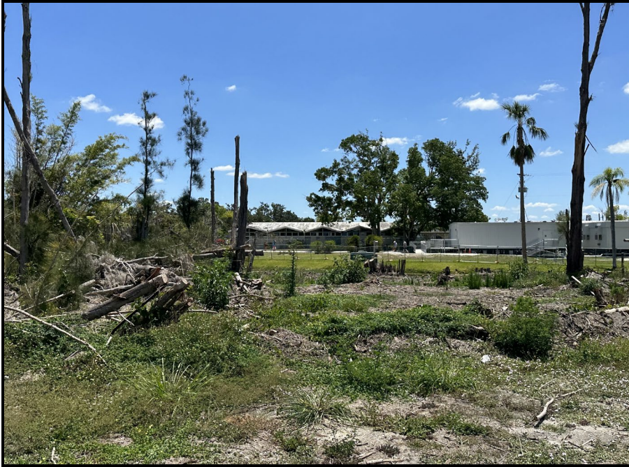
Representative Site Photo: Open Land