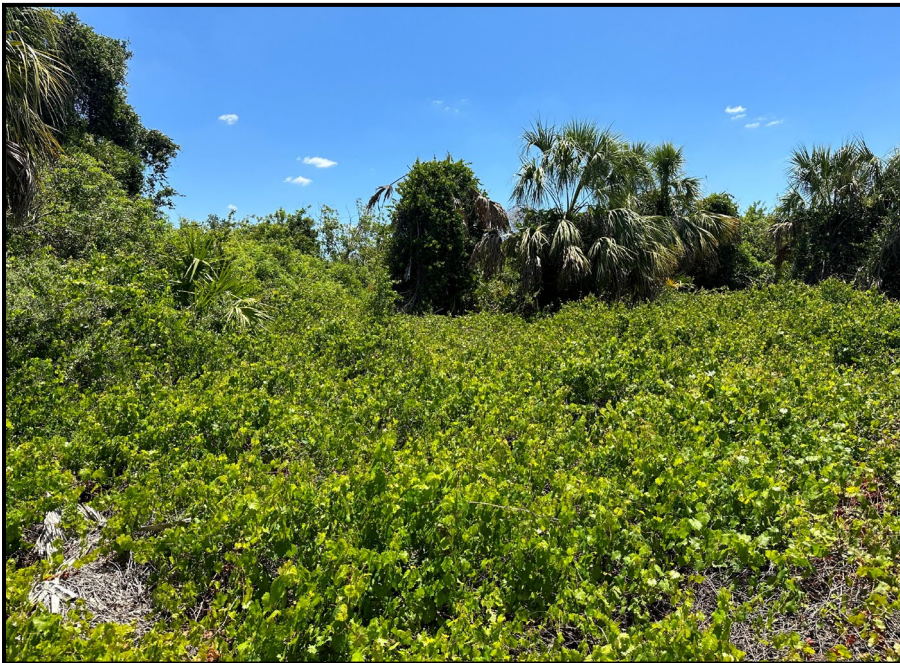
Representative Site Photo: Shrub and Brushland