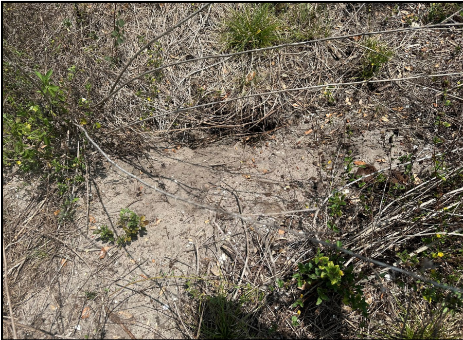
Gopher Tortoise Burrow #57 Potentially Abandoned