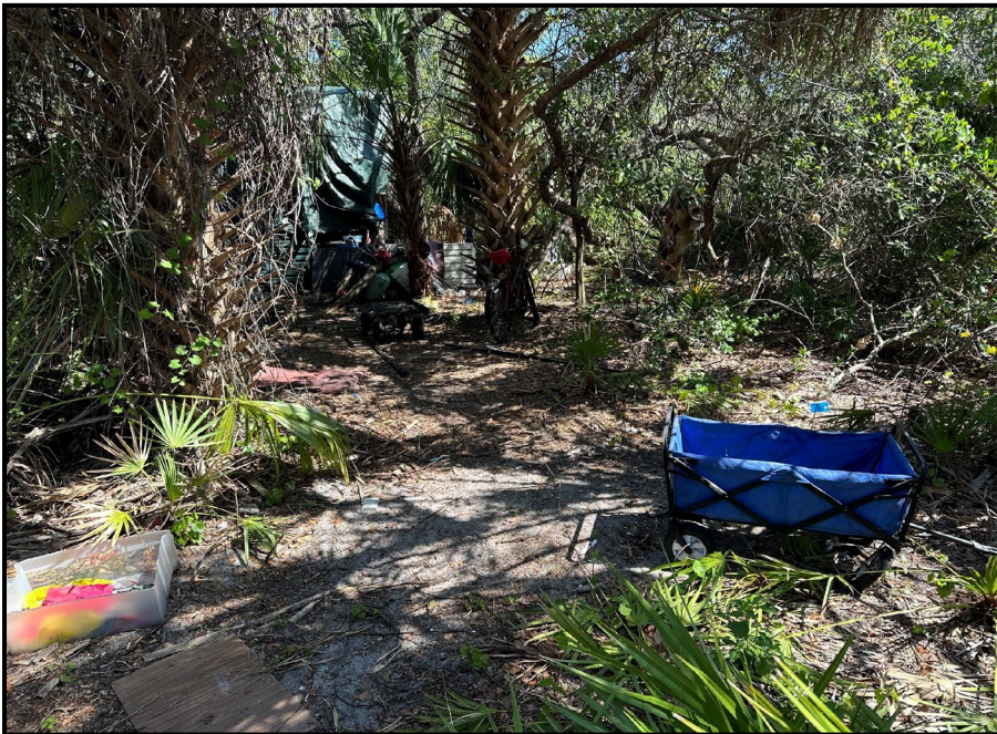
Representative Site Photo: Homeless Encampment