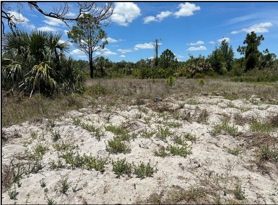
Representative Site Photo: Open Land