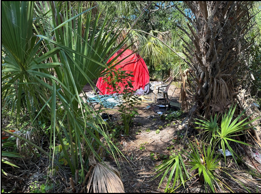
Representative Site Photo: Homeless Encampment