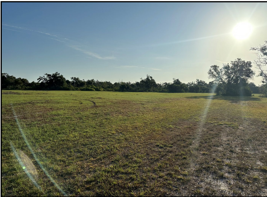
Representative Site Photo: Open Land