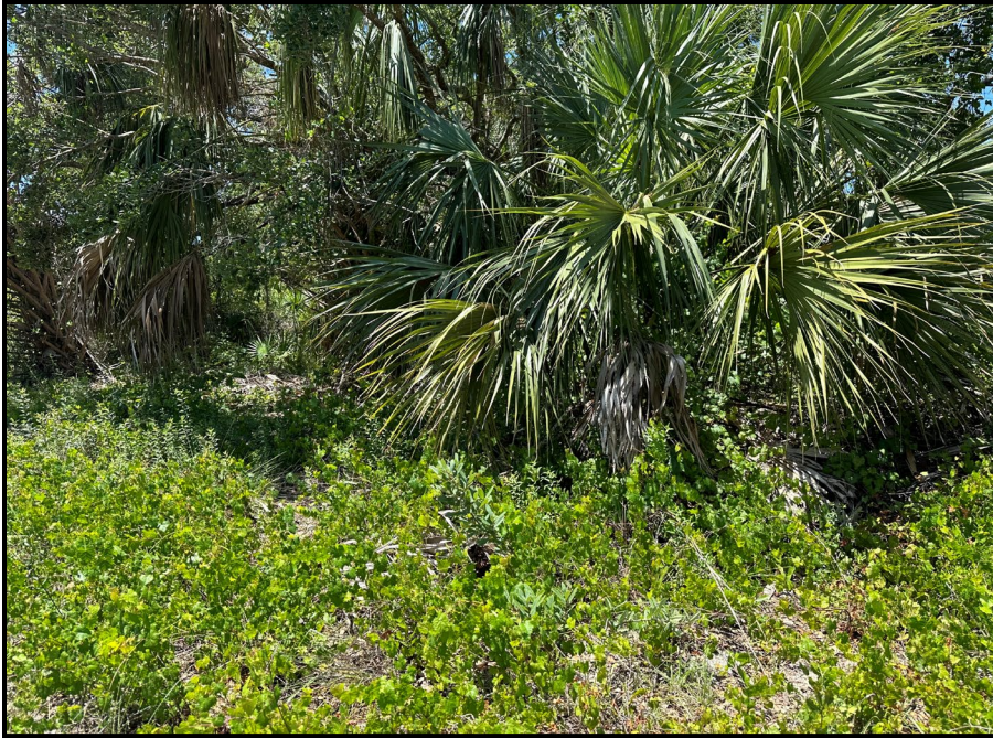
Representative Site Photo: Shrub and Brushland