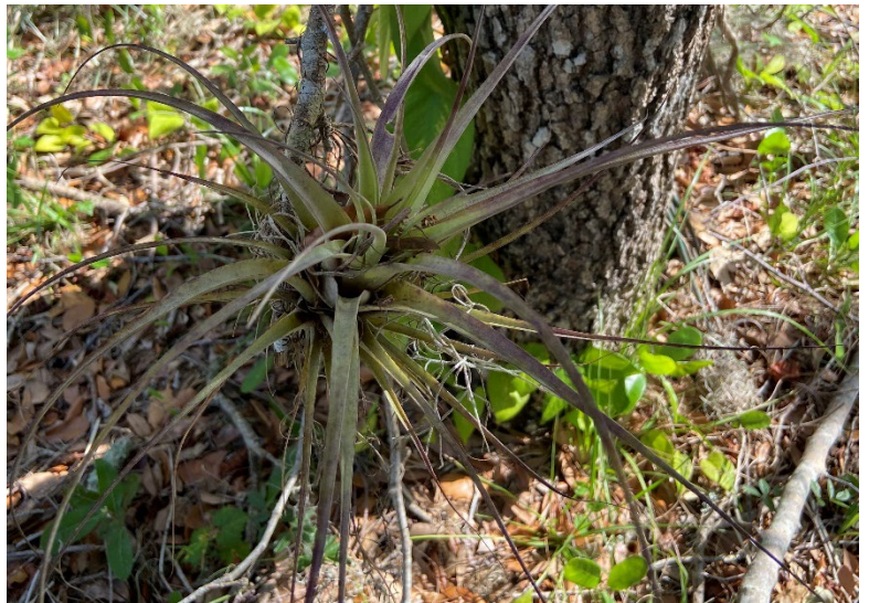
Giant Airplant found in central part of the Survey Area.