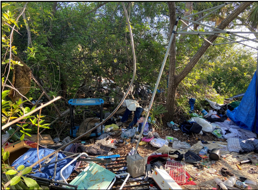
Representative Site Photo: Illegal Dumping