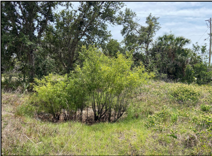
Representative Site Photo: Offsite Depression