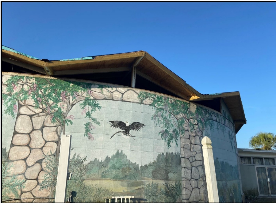
Representative Site Photo: Buildings