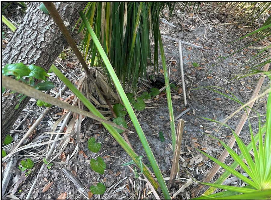
Gopher Tortoise Burrow #29 Potentially Abandoned