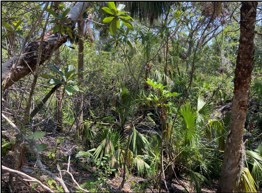
Representative Site Photo: Hardwood Conifer Mixed