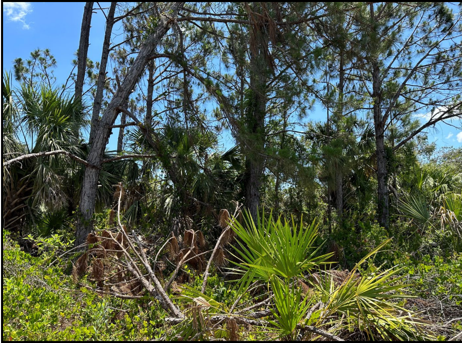
Representative Site Photo: Hardwood Conifer Mixed