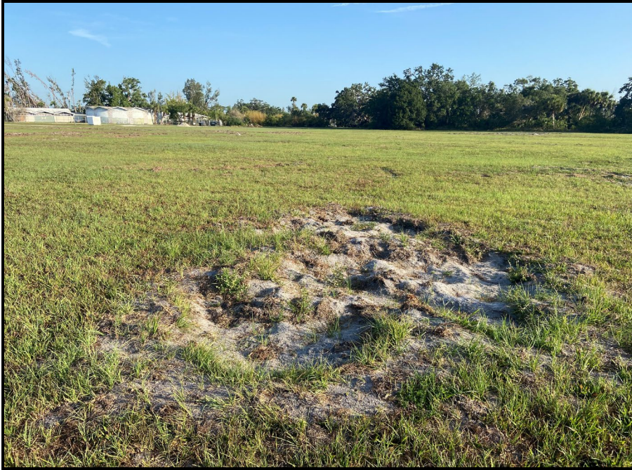
Representative Site Photo: Open Land