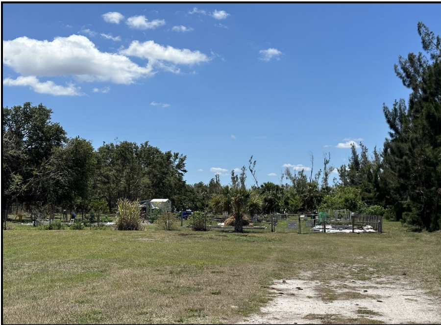
Representative Site Photo: Open Land and Community Garden