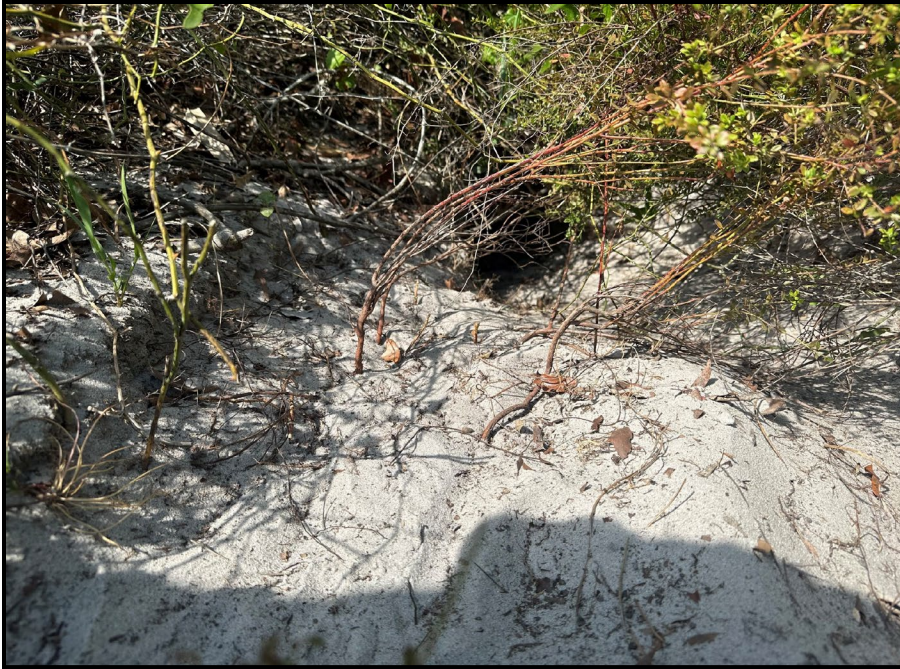
Gopher Tortoise Burrow #46 Potentially Occupied