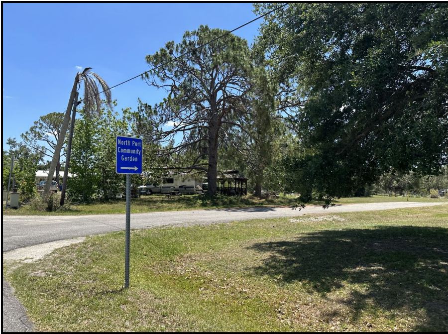
Representative Site Photo: Open Land