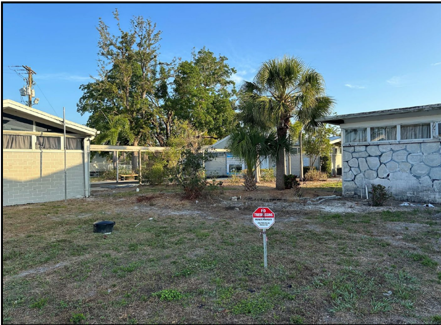
Representative Site Photo: Buildings