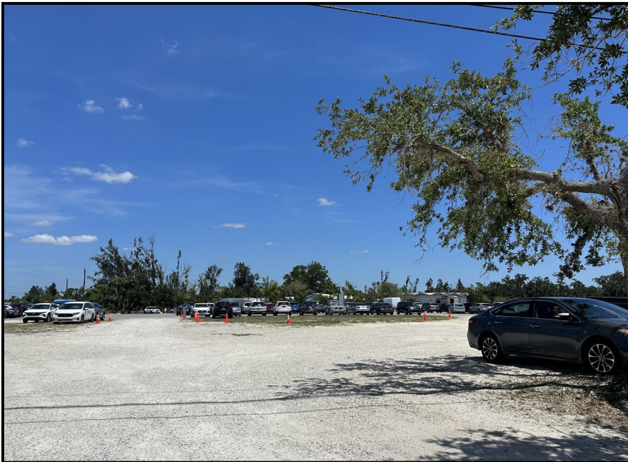
Representative Site Photo: Parking Area