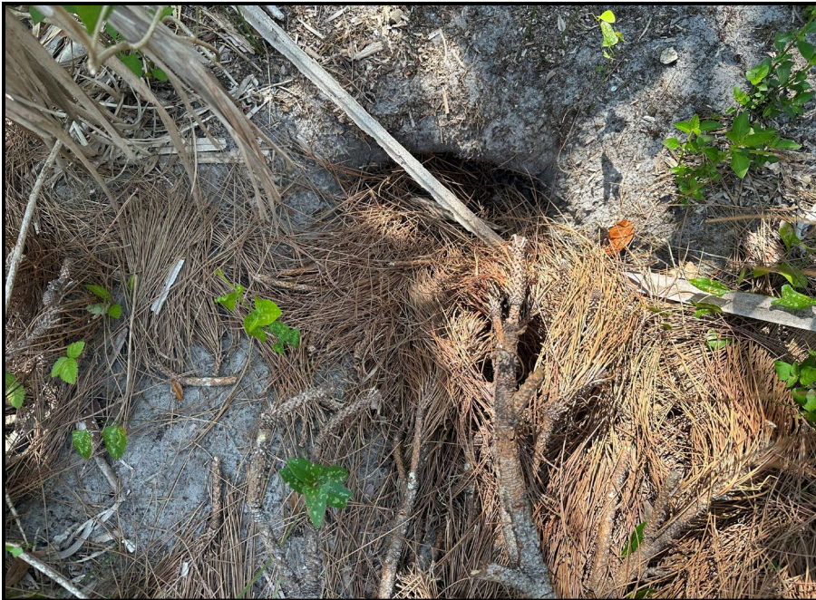
Gopher Tortoise Burrow #48 Potentially Abandoned