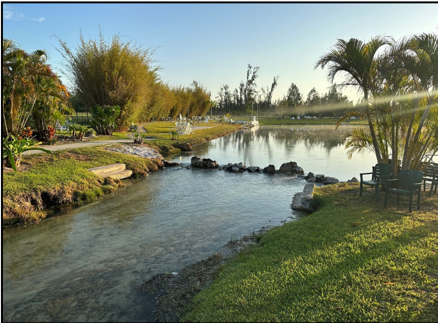
Representative Site Photo: Major Springs