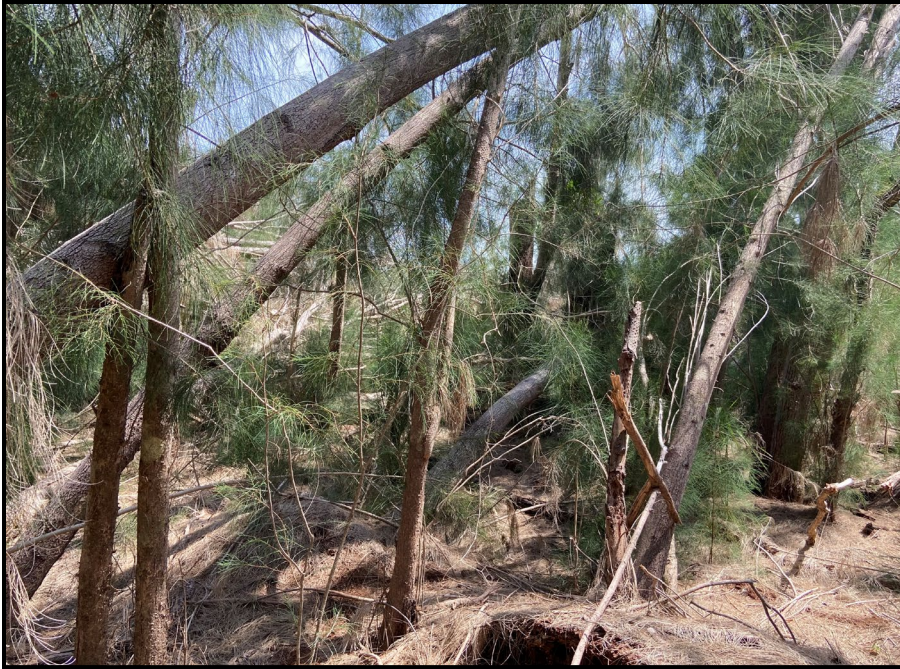
Representative Site Photo: Hardwood Conifer Mixed