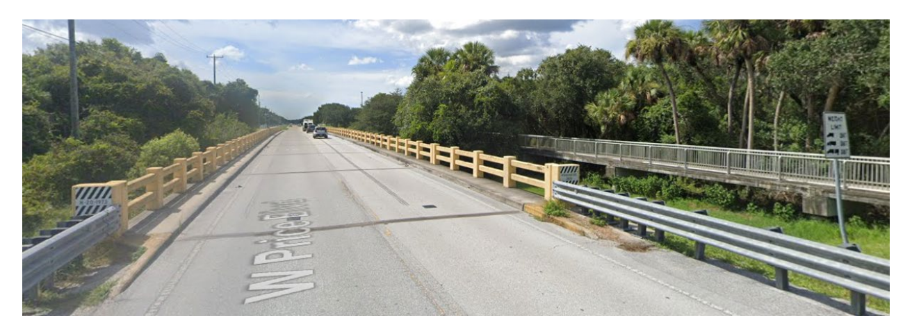
Existing Roadway and Pedestrian Bridge Viewed from East End, Looking West