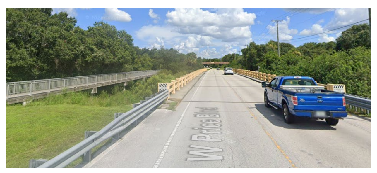
Existing Roadway and Pedestrian Bridge Viewed from West End, Looking East