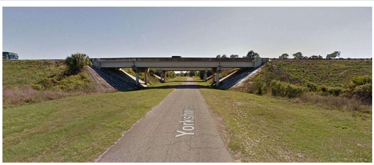
Yorkshire Street at I-75, Looking South Photo Date: April 2011