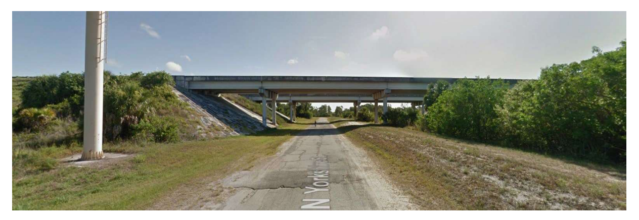
Raintree Boulevard at I-75, Looking North