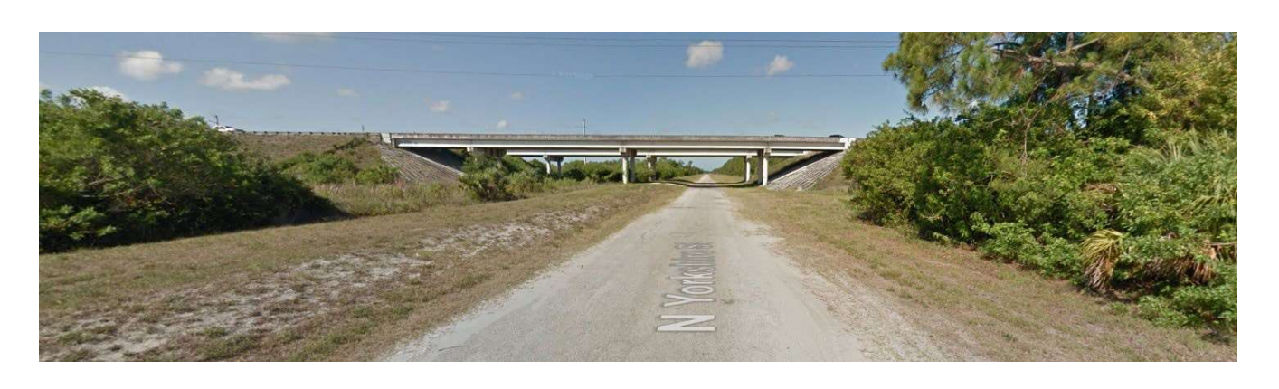
Raintree Boulevard at I-75, Looking South