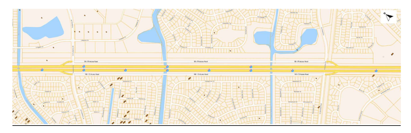
Figure 2. Sketch of Layout of Proposed Interchange (not including changes to local road network)