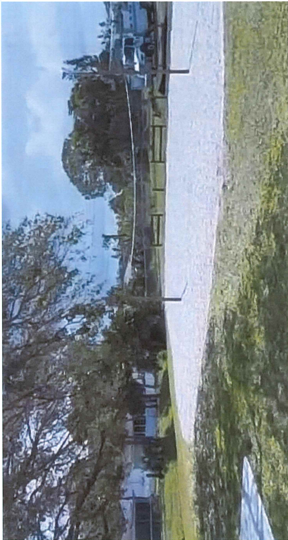
Netting was replaced