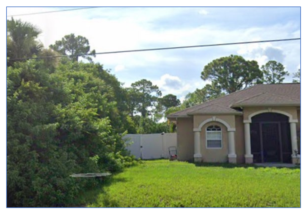
Figure 1. Impinging Growth

Many undeveloped lots are densely vegetated with Category I invasive plant species such as Brazilian pepper, air potato, kudzu, and sewer vine that are causing the eradication of native plant communities and fundamentally altering native habitats. These invasive plants smother, weaken, and kill native trees, leaving them highly susceptible to falling during storms and high wind gusts, and causing damage to homes, power lines, vehicles, and potentially harming people. (Fig. 2 and 3)