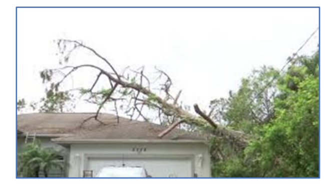
Figure 5. Tree from undeveloped lot that fell on house.

Most pine trees appeared resilient immediately after the hurricane but the stresses from sustained winds, flooding, and soil disturbance became apparent during 2023 as numerous pines began declining. The weakened state of these trees attracted pine beetles, which have now initiated the die-off of many native pines. While dead pines are beneficial to native birds such as woodpeckers for the increased nesting opportunities and availability of insects for feeding, the conflicts with developed properties are becoming increasingly concerning.