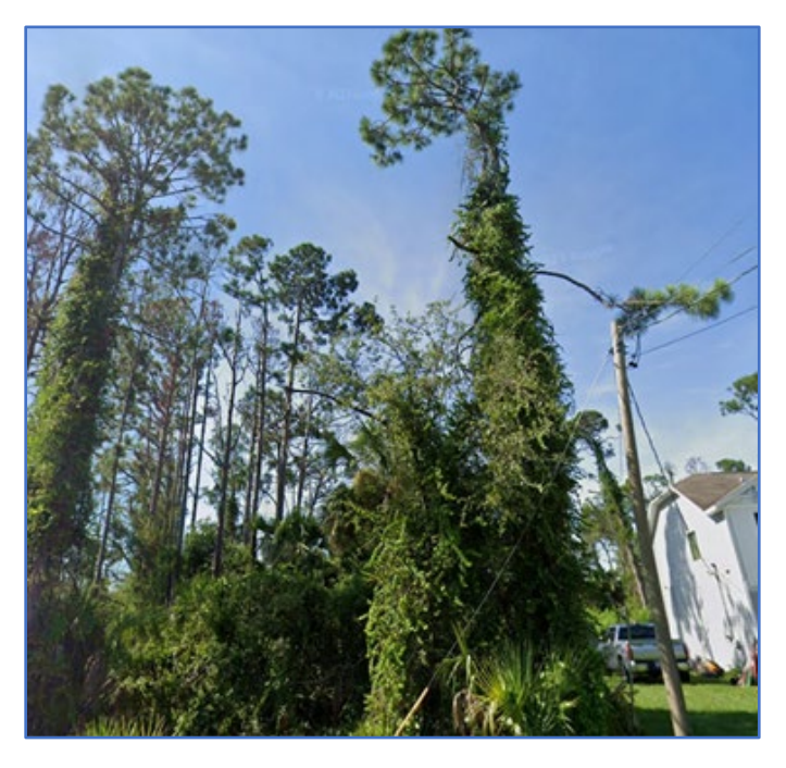
Figure 2. Native pine tree smothered by vines within falling distance of house.