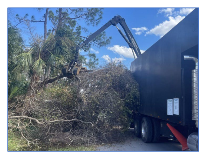
Figure 4. City contracted tree debris removal.

Hurricane Ian highlighted and greatly exacerbated the nuisance issues related to unimproved lots. Unmaintained trees from many of these lots fell onto neighboring homes, properties, and streets, damaging both public and private property, cutting power lines, and blocking emergency access to neighborhoods. The City and residents bore the cost of removing these trees from their properties and streets, with no potential to recover the cost of damages from vacant property owners. (Fig. 4 and 5)