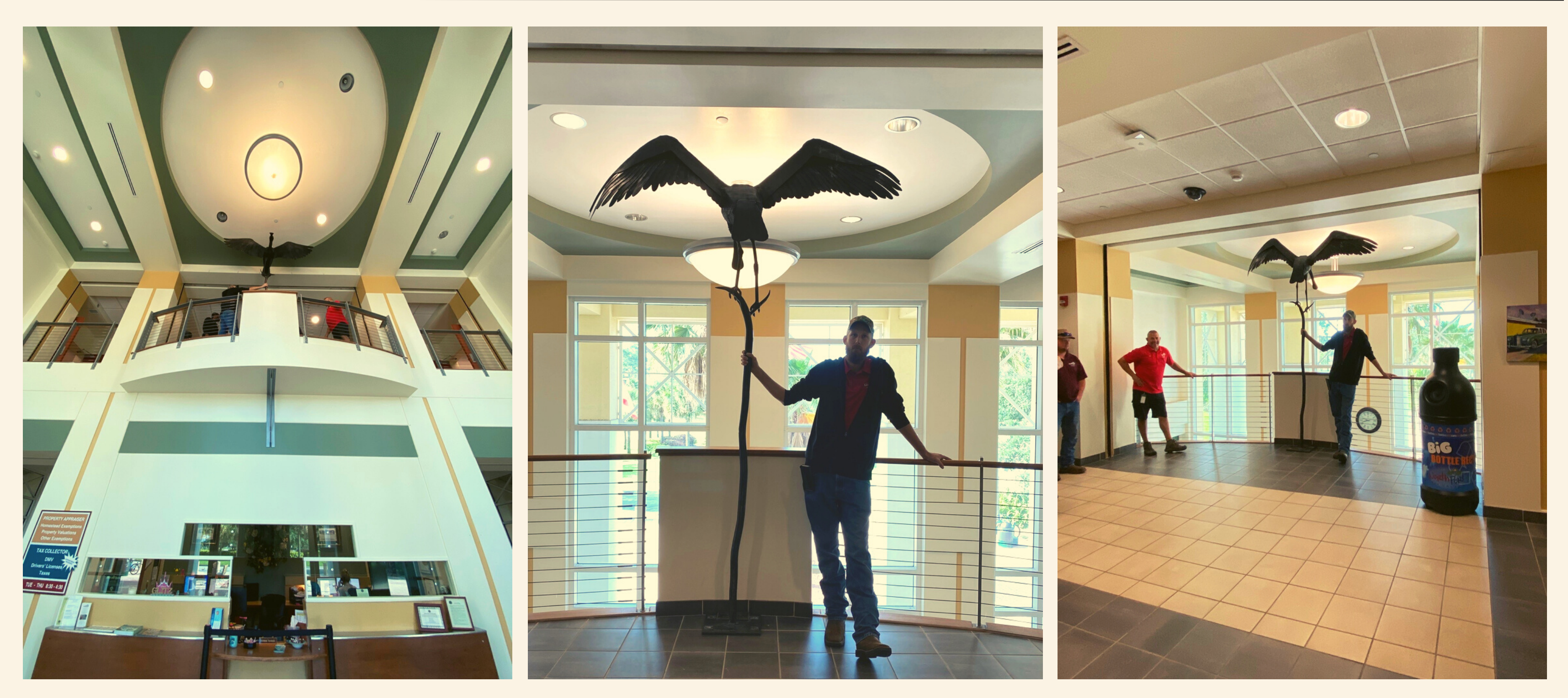
Facing the Main Building Entrance