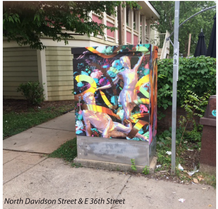
North Davidson Street & E 36th Street