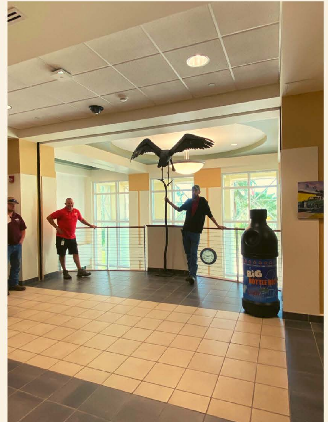
Facing the Main Building Entrance